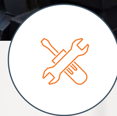
Machinery and tools